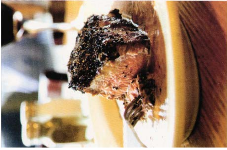
At Ray's the Steaks in Arlington, cuts such as this New York strip are generously carved and reasonably priced.

Franco-American bistro also offers lobster, tuna, and shrimp patties.